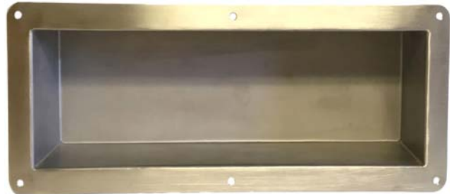
NW 619 FM Shelf

Note: NW 619FMPC, Powder Coated Shelf Available.