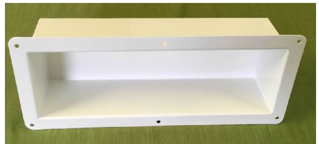
NW 619 FMPC Powder Coated Shelf

Northwest Specialty Hardware, Inc. 15865 SE 114th Avenue, Suite C Clackamas, OR 97015 Phone (503) 557-1881 Fax (503) 557-1885 Email: sales@northwestsh.com