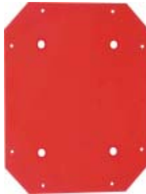
NW 604-1 MIRROR BACKPLATE

Note: Discount price for one complete set of the mirror, backplate, and anchor kit.