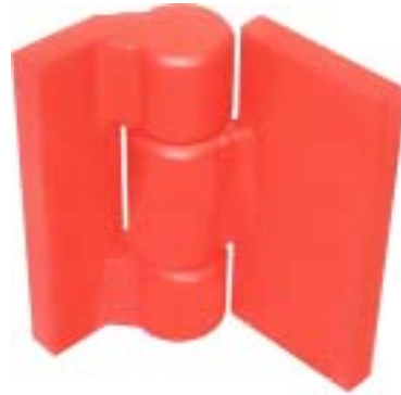
NW 650FSW-SL FULL SURFACE, SHORT LEAF