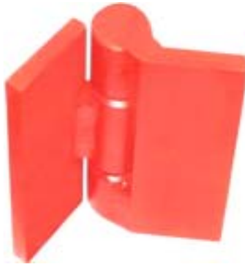
NW 650HSW HALF SURFACE, WELD-ON